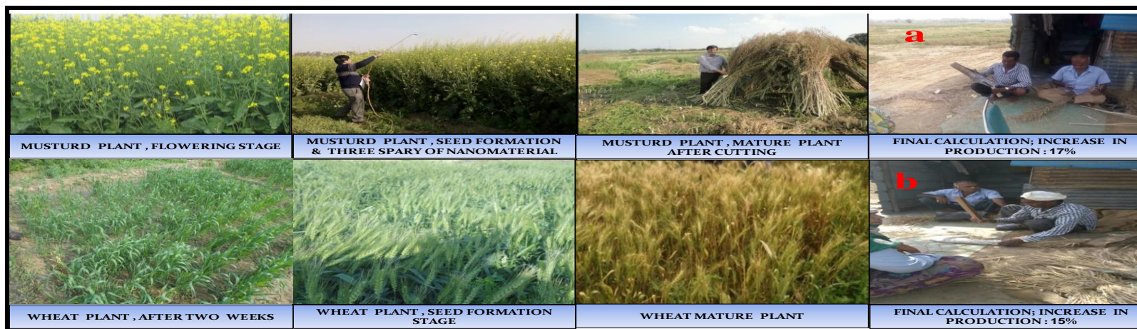
Figure: Field experiments to enhance crop production (a) Mustard and (b) Wheat